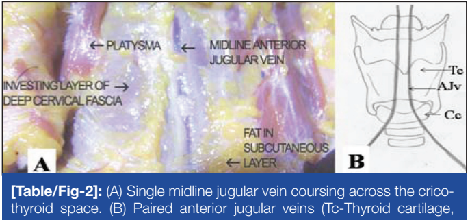
thyroid space. (B) Paired anterior jugular veins (Tc-Thyroid cartilae Cc-Cricoid cartilage, AJv-Anterior Jugular vein).

The pyramidal lobe of the thyroid gland was seen in 10 cases (16%), to lie anterior to the cricothyroid membrane [Table/Fig 4a].